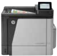
HP Color LaserJet Enterprise M651dn

Count on performance. Print professional-quality, two-sided color documents—letter and A4—with outstanding reliability. Efficient one-touch printing and mobile printing options plus simple management help you be productive wherever work takes you.